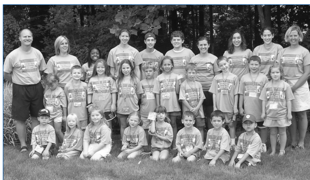
CYO Grasshopper Day Camp at OLF from July 5-8