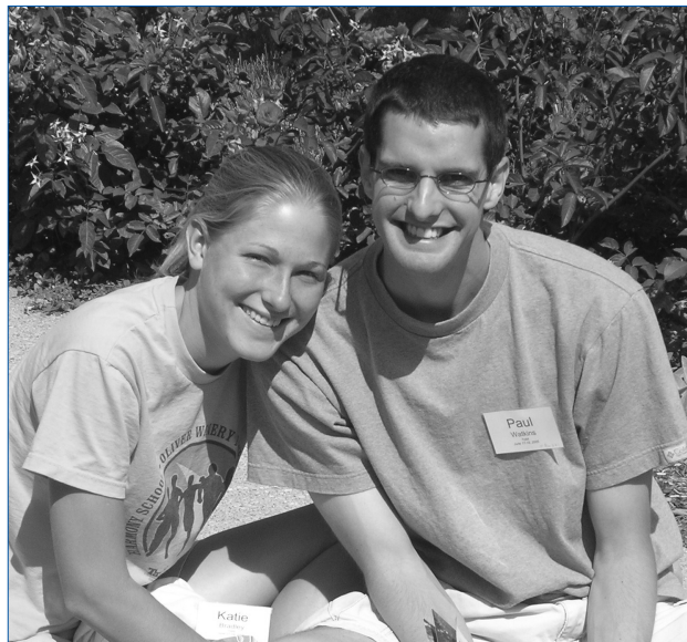
Engaged couple on Tobit Weekend